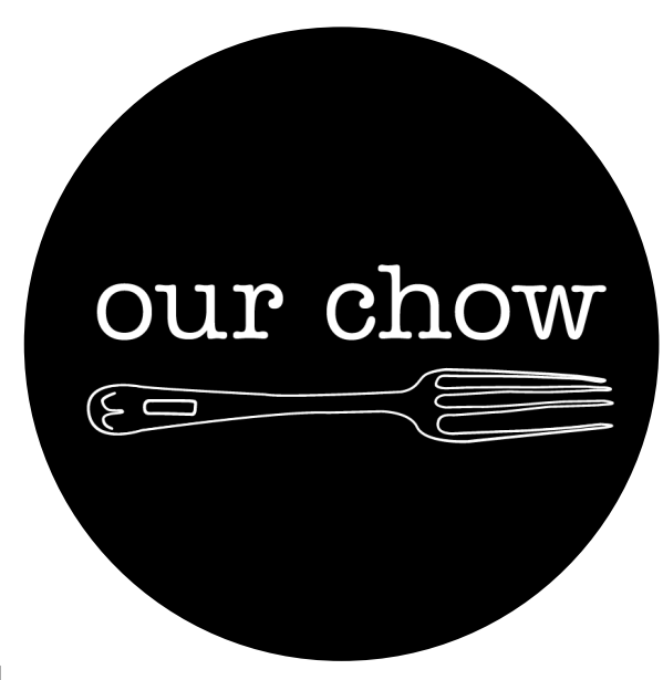
by Mudgee Catering Co